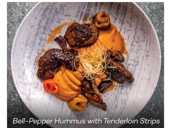
Bell-Pepper Hummus with Tenderloin Strips