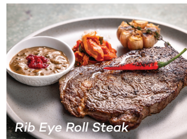
Rib Eye Roll Steak