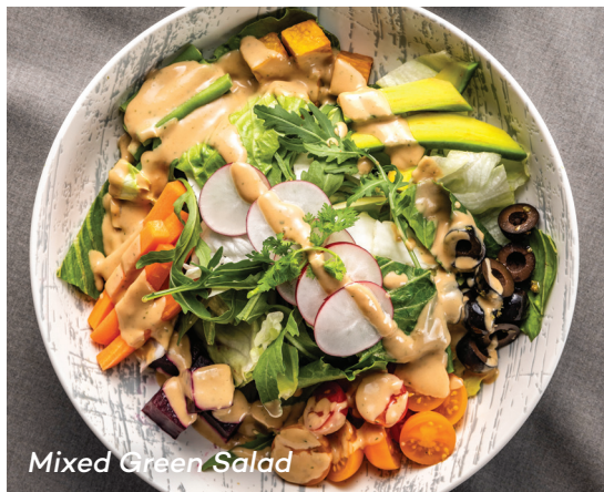
Mixed Green Salad