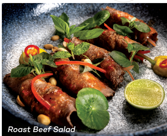
Roast Beef Salad