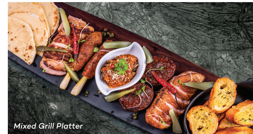
Mixed Grill Platter