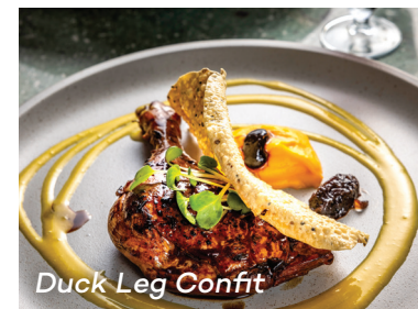
Duck Leg Confit